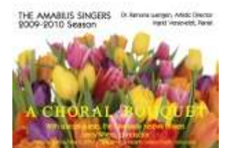
A Choral Bouquet