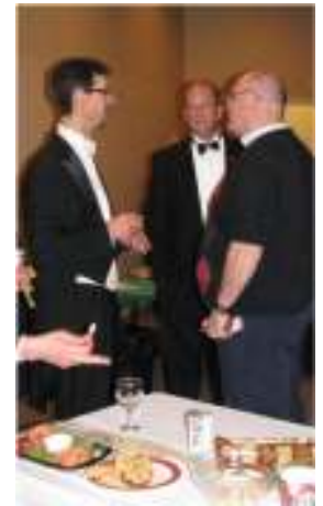
Schmoozing with the Bass Soloist

The weekend following the Kelowna concert, OFS will travel to Vancouver to repeat this concert in front of an Amabilis Singers' audience. Your friends and family in the Lower Mainland can join us for this concert May 1st at Shaughnessey Heights United Church, 1550 W 33rd Ave. (1 block west of Granville), Vancouver. http://amabilissingers.wordpress.com/tickets/