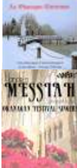
OFS, orchestra and soloists perform Messiah to Sold Out House