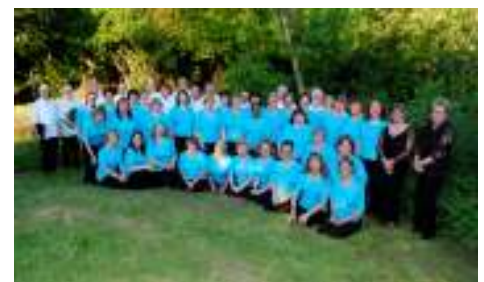
The Amabilis Singers